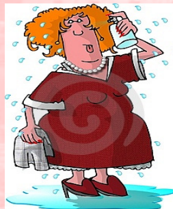
Studies have shown that 85% of US women experience hot flashes as they approach and/or during menopause.

ble for temperature control, and cause it to read “too hot.” In response, the body sweats in an attempt to relieve the