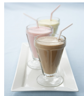
This drink delivers many health benefits and tastes great too!

291 calories, 10g protein, 51g carbohydrates, 6g fat, 0 cholesterol, 1g dietary fiber, 40mg isoflavones. High in protein, vitamin C, vitamin D, folate, calcium, copper, and magnesium. A good source of carbohydrates, iron, potassium, and zinc.