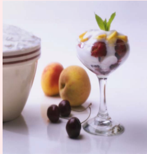
Cool down those hot flashes with this frozen summer treat!

Recipe courtesy of The Change of Life Diet and Cookbook by Elaine Magee